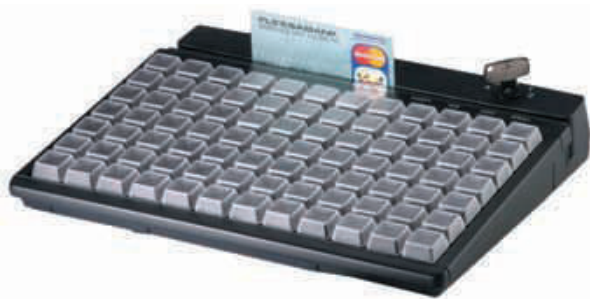
MCI 84BMKU with MSR and Keylock