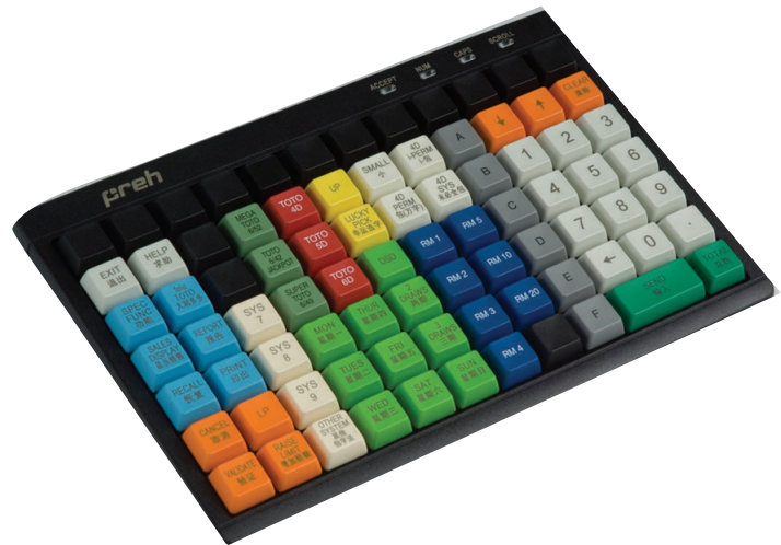
Customized MCI 84