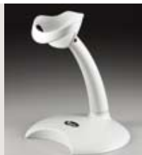
> AS-8000 stand